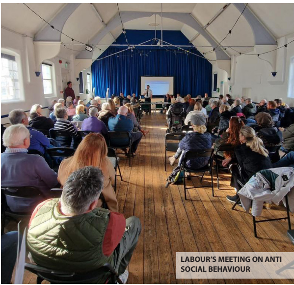
LABOUR'S MEETING ON ANTI SOCIAL BEHAVIOUR